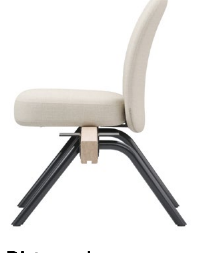
Distance legs Designed for placement 40 mm from the wall.