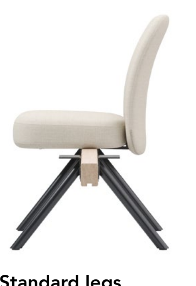
Standard legs Designed for standalone