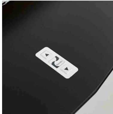
The control for height adjustment