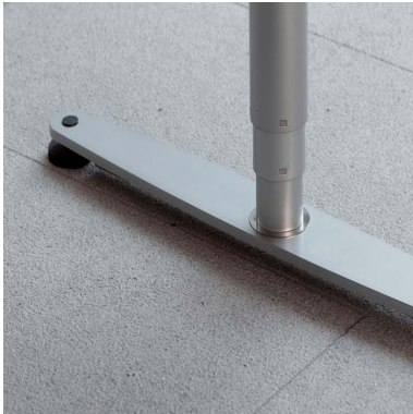
Metal frame in light grey metal