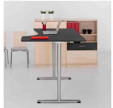
Workstation, motor-driven height adjustment