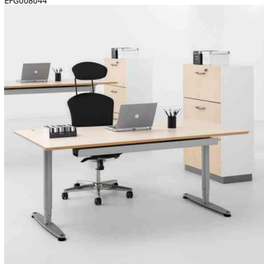
Workstation with cable trough