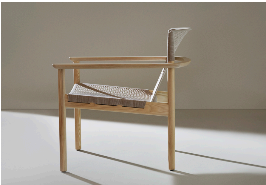
Evo is made of wood, in ash, oak or black-stained ash finishes. The chair is available with or without armrests.