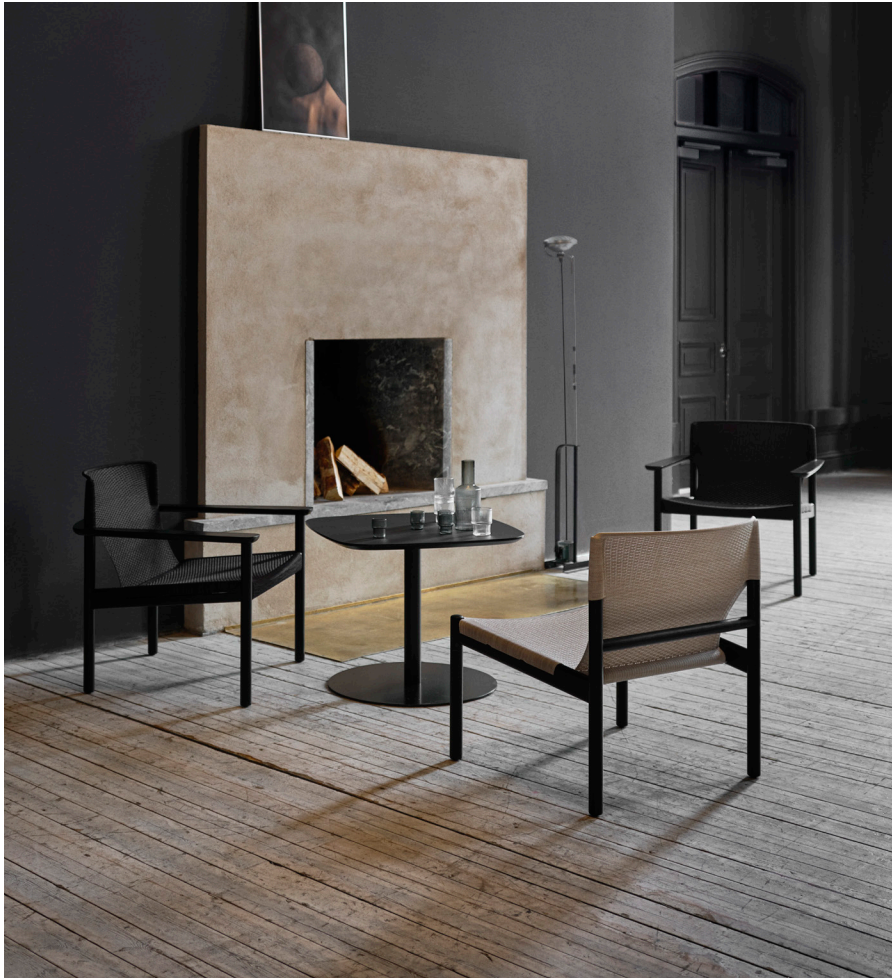
All finishes of wood and fabric colours can be combined.