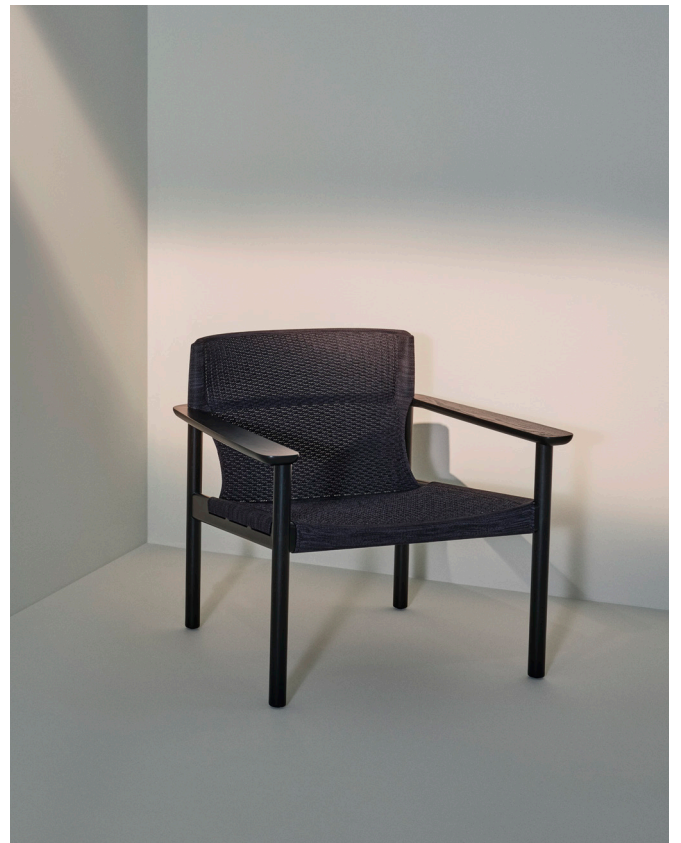
The seat and back are made of a single piece of 3D-knitted fabric. Colours Beige Melange and Black Melange.