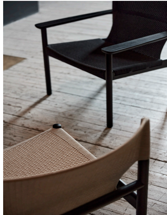
The textile can be replaced if needed.